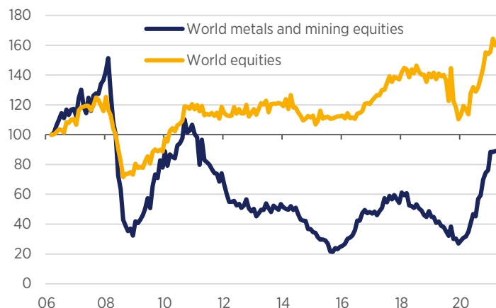
Earnings per share (rebased) for world metals and mining equities and world equities